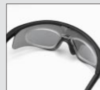
Optional Rx insert