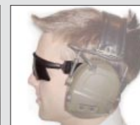
Sawfly STP Protective Eyewear Fits under headsets preventing noise leakage.